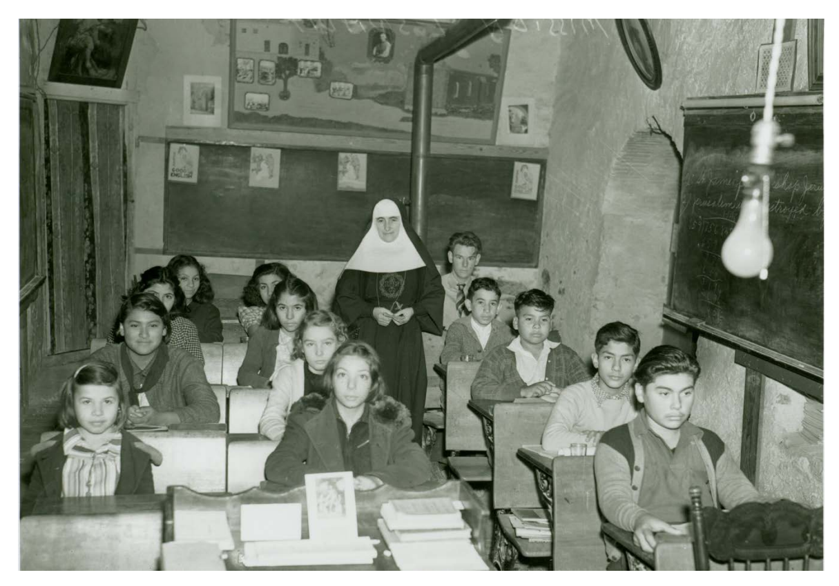
An Incarnate Word Sister teaching at the school at Espada Mission, now a UNESCO World Heritage Site. Join our Historical Tour, March 24 or October 6, 2018 <u>http://www.uiw.edu/eccl/Special-Events/Historical_Tour/index.html</u>