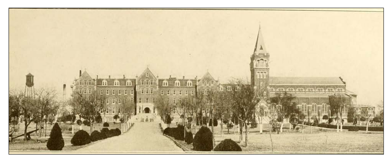
Incarnate Word College and Academy and Convent. C. 1920