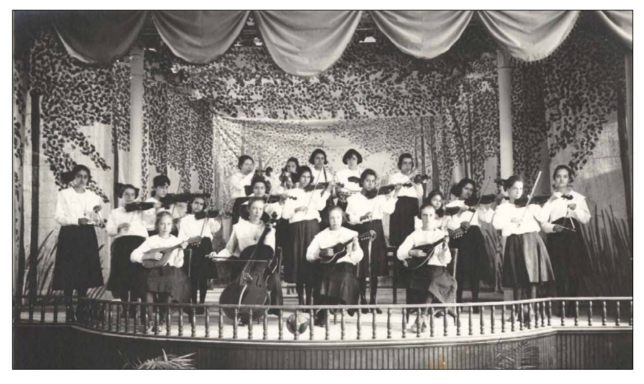
College and Academy of the Incarnate Word Orchestra, c. 1910, in St. Cecilia's Hall. Beauty nourishes the spirit and has art, drams, dance, and music at Incarnate Word have been a service to the city.

The second concept is that of trying to cultivate empathy within students. If social justice and community are based on relationships, we must learn to cultivate empathy for those from whom we differ. Hence, I will explore a variety of ways in which this can (theoretically) be done, such as imagining other worlds and practicing an ethic of care. If we hope our students will become life-long learners and continue to be active participants in their local and more global communities once they graduate, it is not enough to simply have them "do service." Rather, we will most likely need to promote an affective change—cultivate empathy—within them that will remain past their graduation day and far into their futures.