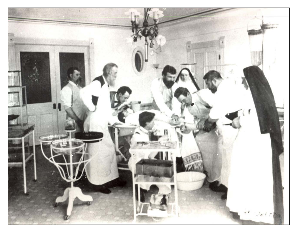
Santa Rosa Hospital was the first public health care in San Antonio and opened in response to the mayor's request for help. The history of Incarnate Word is one of responding to civic needs.