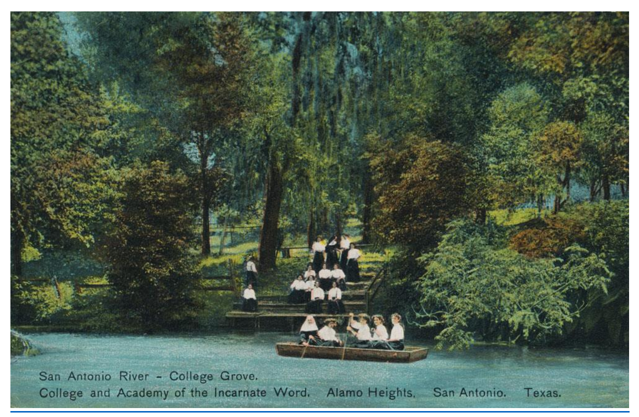
Incarnate Word students in 1907 at what is now called the Headwaters Nature Sanctuary