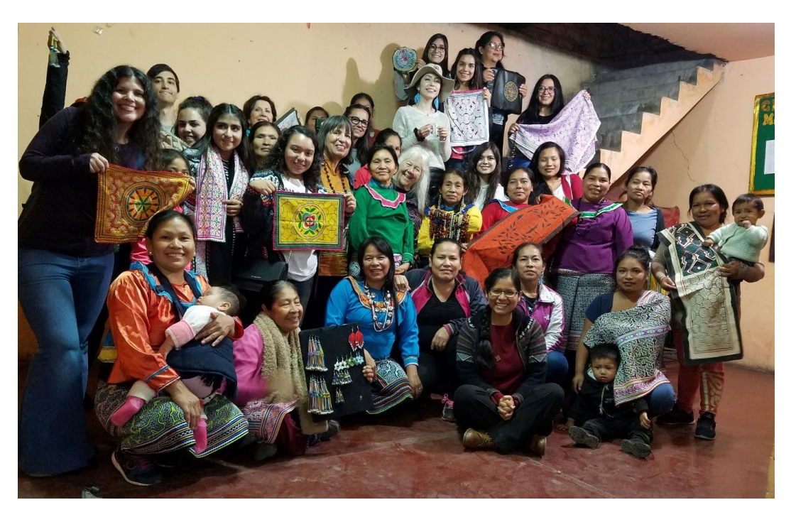
Learn of the women, see film, and connect with them by using their crafts.

The Shipibo women are indigenous peoples from the Amazon rainforest along the Ucayali River. The women along with their families have been displaced from their natural habitat due to deforestation in the Amazon. They live in what used to be the Lima dump site, Cantagallo. Without access to sewage, water lines, or infrastructure, they sleep in manmade tents, and have limited resources available to better themselves. Despite this misfortune, the Shipibo women are fighting for equality not just for the women, but for the Shipibo tribe which is being treated unjustly after the government promised that they would help conserve their culture.