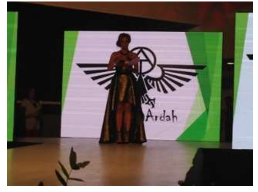
First Annual Fashion Show, Irapuato, Mexico for the UIW Bajio Campus, February 9, 2017

(SD=1.20); 54% were Psychology majors. The outcome measures assessing satisfaction with, enjoyment of, and interest in the service-learning experience were significantly correlated so they were combined into a single Overall Satisfaction with Service Experience (OSSE) outcome measure. A regression analysis conducted with participant characteristics as predictors of OSSE was not significant [F(9,8) = .885, p > .05]. Students reported a high level of satisfaction with their service experience (M=4.33; SD=.59) and interest in participating in a future service-learning course (M = 4.27; SD=.96). They also indicated they believed that their experience related to the principles of social psychology (M=4.35; SD=.80). Although participants indicated a high level of interest in serving with fellow students, they also indicated they would not mind serving alone (M =4.46; SD=.51 and M=4.38; SD=.64, respectively). All responses to the open-ended question (n = 11; 42%)indicated a desire for more interaction with the people being served by the community organization. Given this student feedback, future research will investigate satisfaction with service experiences based on degree of direct involvement with service-recipients. Future research will also focus on the role of participating in service with others as an influence on desire to serve and satisfaction with the service experience, as well as possible ethnic or cultural differences in perceptions of service-learning experiences.