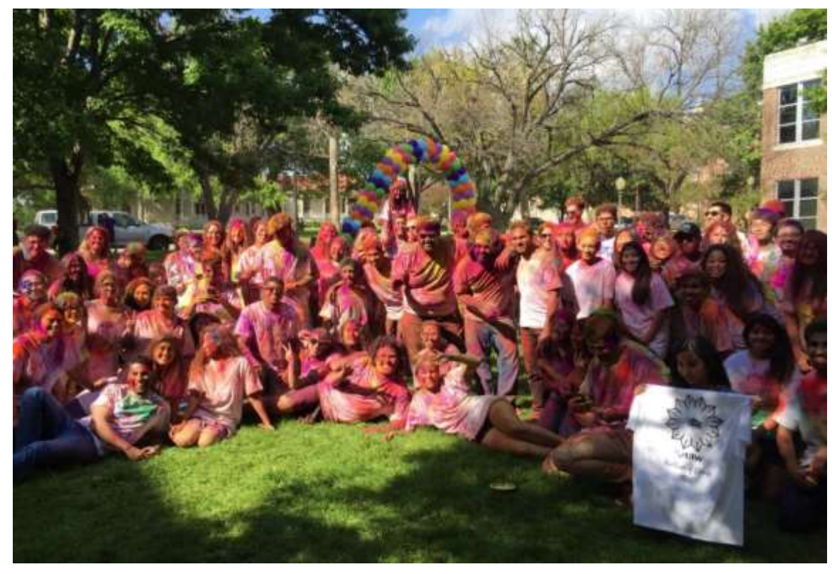
Holi, the spring holiday introduced by Hindu students and faculty from India, is celebrated at UIW enriching both internationals and locals.

vaccination fairs each year of their education. Many of these events are held in underserved areas, and are aimed at increasing health awareness, education, and service to those most in need. Certainly some of these activities are considered service learning opportunities, and will play a key role in the growth (professional and personal) and development of well-rounded pharmacists who promote social justice. Students will be required to complete a minimum number of co-curricular events each year, and will provide a reflection on their professional growth and development (increasing self awareness) each year.