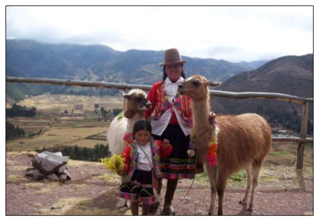
From the Peruvian Andes where people have benefited from the radio programs.