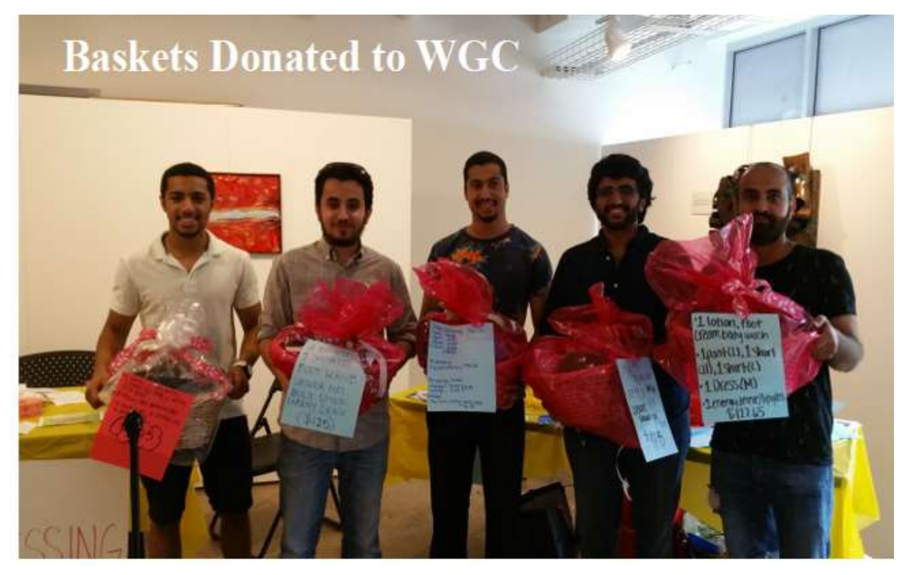
HEBSBA students help Women's Global Connection, a ministry of the Incarnate Word Sisters.

Overall, service-learning based projects teach individuals life-long learning skills and will enable students to network and collaborate with community members in the San Antonio region. Most importantly, the Day of HOPE educates students on how to become enlightened citizens, which coincides with the University of the Incarnate Word's mission.