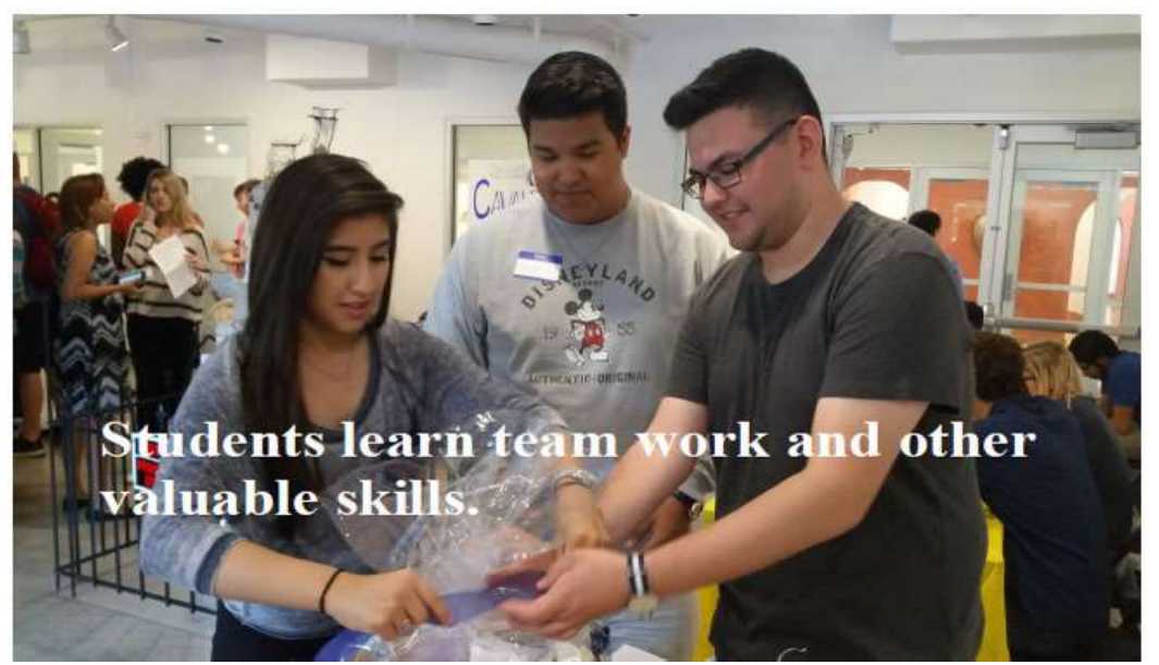
At a "Day of HOPE" students learn team work.

Relevance: The SoPT faculty desire to showcase how service learning has been integrated into the curriculum structure, to discuss benefits for students and faculty, and to share lessons learned. The hope is that others will glean ideas to integrate, or further incorporate, service learning experiences into their class(es), and to collaborate with others within their professions to thread service learning in a sequential manner throughout the curricula.