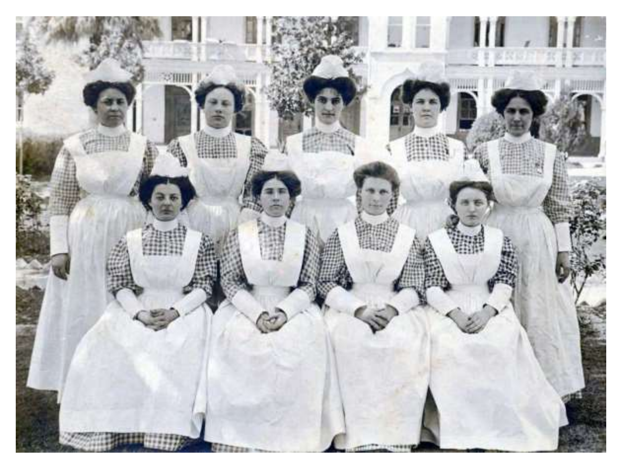
Archives of the Sisters of Charity of the Incarnate Word