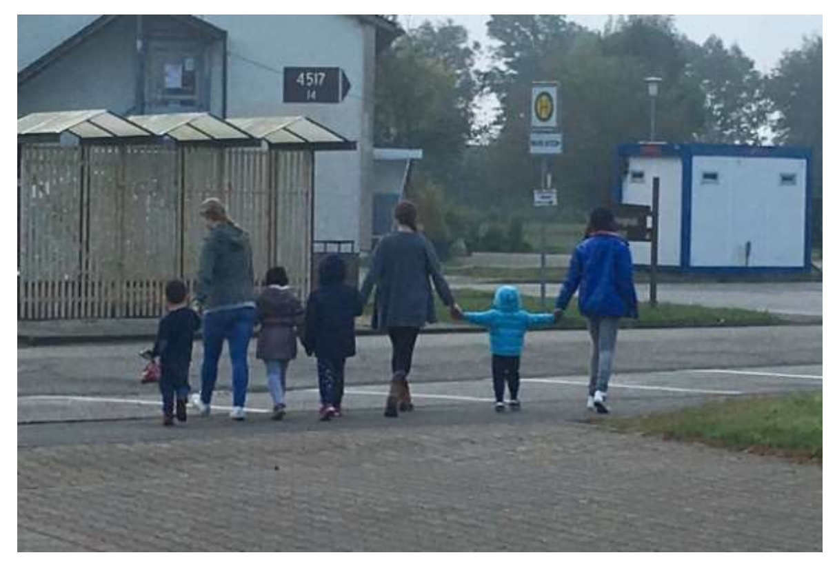
UIW European Study Center Students Supporting Patrick Henry Village Refugees in Heidelberg Germany, fall 2016.

EFFECTIVENESS VoteSA will be using the campaign designed by UIW students in San Antonio's 2015 upcoming elections. The students learned how to empower the vote with their own talents and voices.